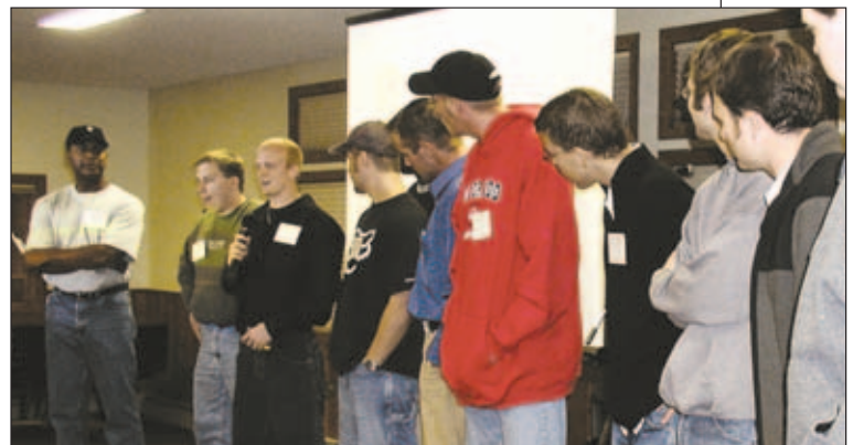
The challenge gift and campaign will enable LMM to move toward financial self-sufficiency and strengthen such ministries as the Young Men's Ministry. Pictured here are members of the Young Men's Ministry Council.

The Master Builders Bibles are in the hands of over 25,000 men. This Bible ministry is being expanded with easy-to-read Spanish New Testaments that will be given to congregational groups