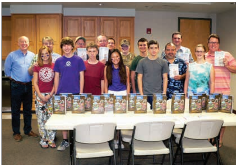
Every confirmation student’s dad received the Master Builders Bible for Men this year at Zion Lutheran Church in San Antonio.

The evening was well received. Men’s leaders were able to give confirmation dads tools to mentor their sons. Most of the dads involved encouraged repeating the event next year – and Zion’s men’s ministry added several men who had not been involved in their ministry.