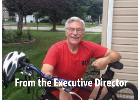
From the Executive Director