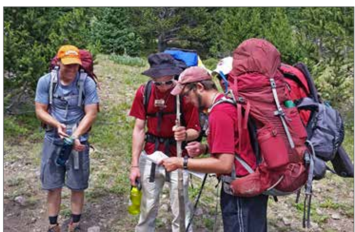
Lutheran Men in Mission Fall 2016 Newsletter Page 6