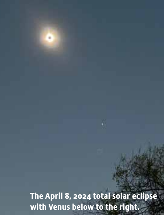
The April 8, 2024 total solar eclipse with Venus below to the right.